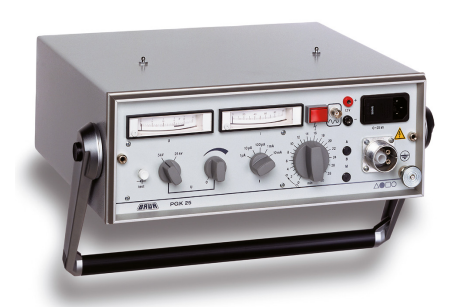
The figure is illustrative.